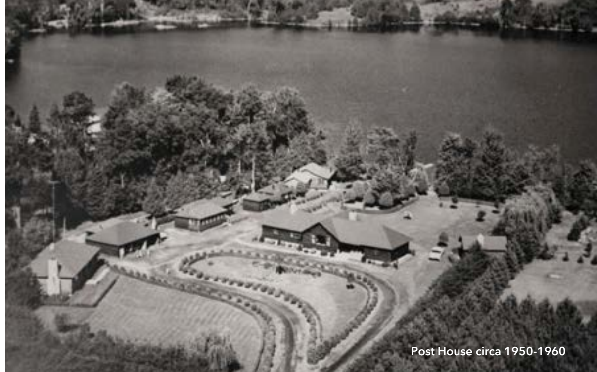
Post House circa 1950-1960

Today the modernized Post House encompasses 16 rustic luxe accommodations, flexible event space for up to 32 guests, a top-notch fitness studio, outdoor activities, and all the “mod cons” - like EV charging stations, and seamless wifi.