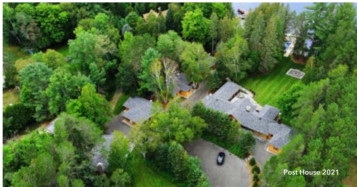
Post House 2021

WELLNESS yoga & adventure retreats, health, sport & outdoor companies, family gatherings