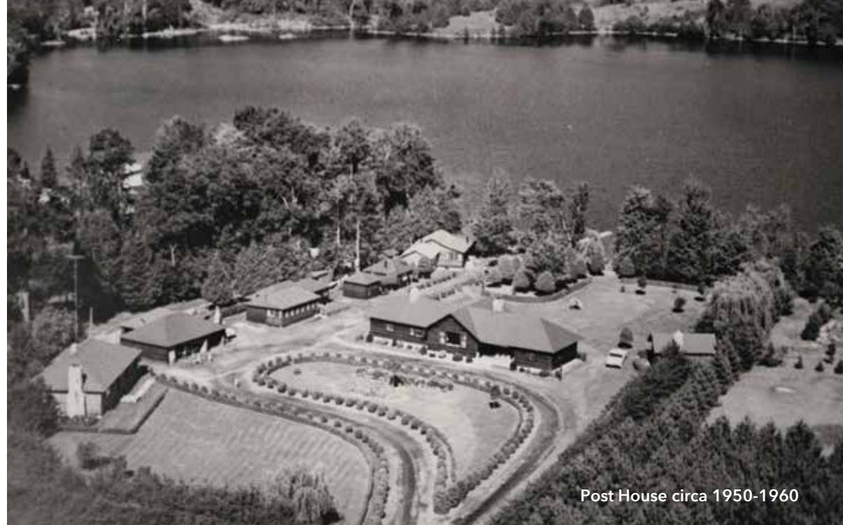
Post House circa 1950-1960

Today the modernized Post House encompasses 16 rustic luxe accommodations, flexible event space for up to 32 guests, a top-notch fitness studio, outdoor activities, and all the “mod cons” – like EV charging stations, and seamless wifi.