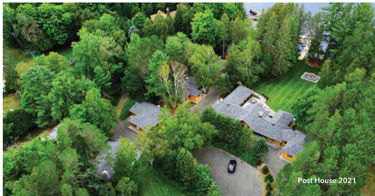
Post House 2021

WELLNESS yoga & adventure retreats, health, sport & outdoor companies, girlfriend getaways