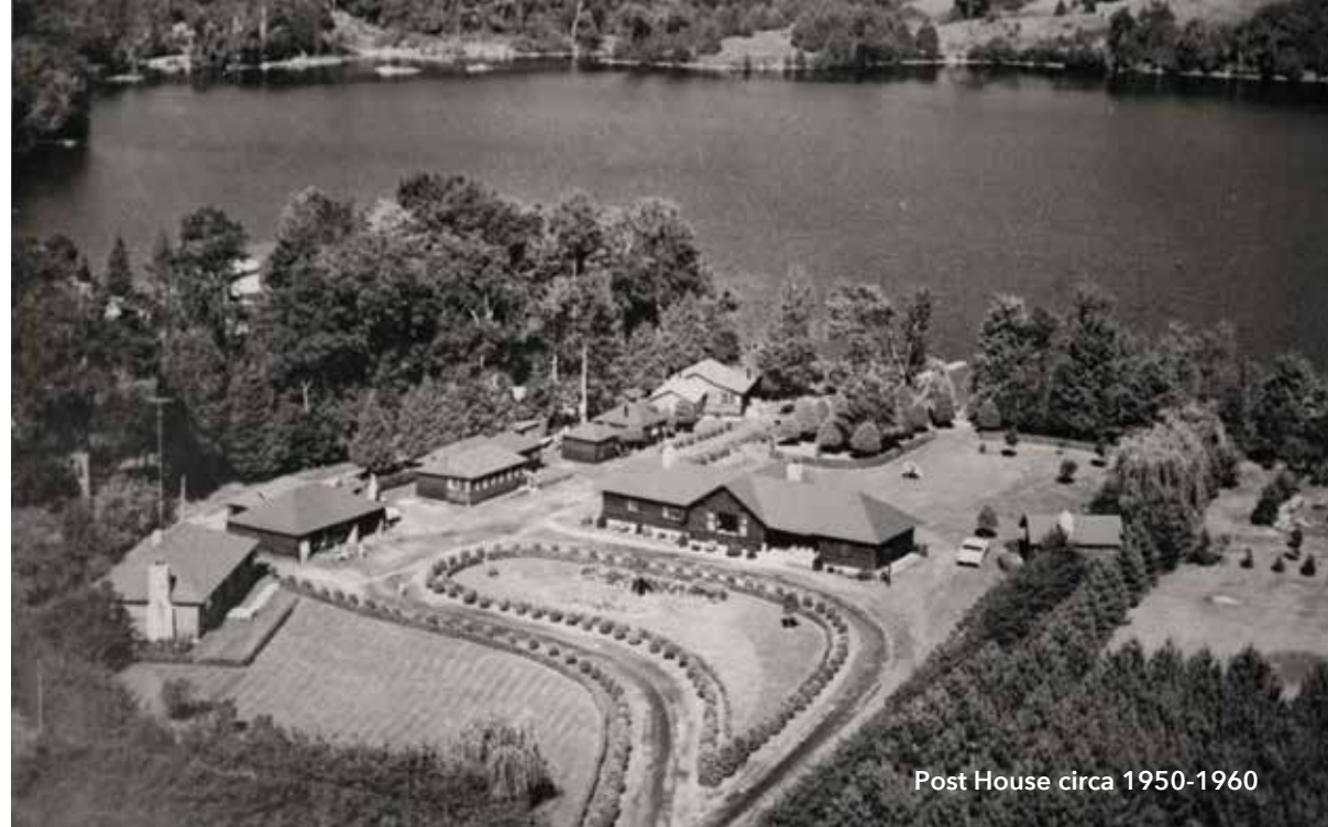
Post House circa 1950-1960

Today the modernized Post House encompasses 16 rustic luxe accommodations, flexible event space for up to 32 guests, a top-notch fitness studio, outdoor activities, and all the “mod cons” – like EV charging stations, and seamless wifi.